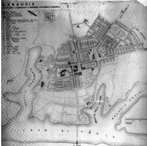
Figure 4 - The map of Sabaudia. < http://piliaemmanuele.wordpress.com/2008/04/ >

The architectonic scenery of Sabaudia positioned around two great public spaces, one of them being destined to eventual political meetings, represented a commitment of the form with its ideology. A form based on a geometrically closed system, and crowned with an architecture known for its vertical elements, the tower, the city hall and the church's tower.