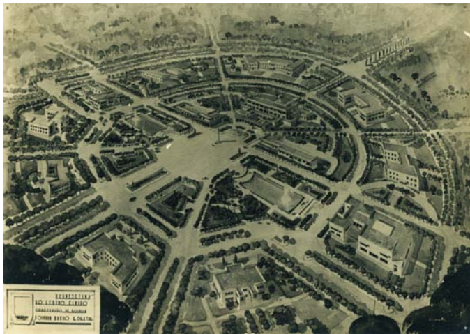
Figure 2 – Perspective plan of Atilio Correa Lima . IBGE.