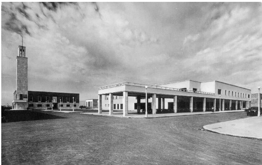
Figure 5 - The place of the revolution. < http://www.radio3.rai.it/dl/radio3/programmi/archivio/ContentSet >