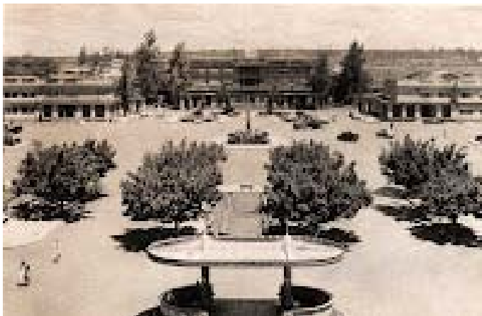
Figure 3 – Goiânia Civic Square, in the 1930s . IBGE.